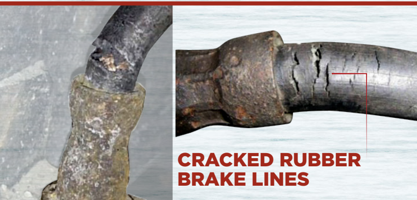
CRACKED RUBBER BRAKE LINES