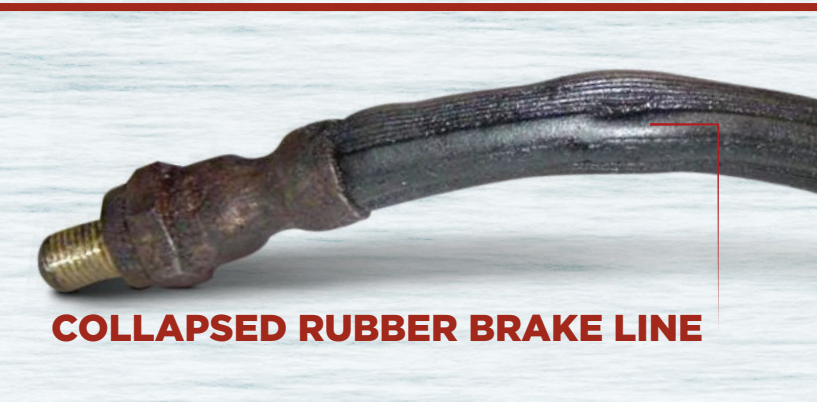
COLLAPSED RUBBER BRAKE LINE