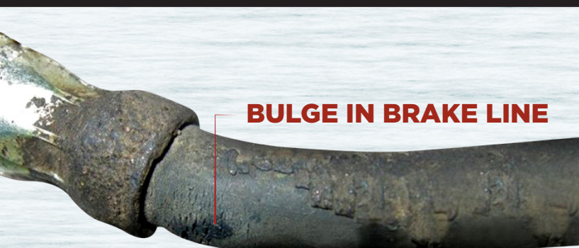
BULGE IN BRAKE LINE

VISUAL SIGNS IT'S TIME TO REPLACE BRAKE HOSES